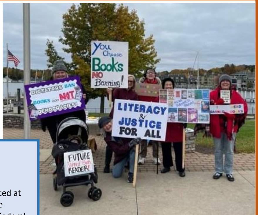
Hardy protestors in Charlevoix marching against book-banning.

When a man assumes a public trust he should consider himself a public property. -- Thomas Jefferson