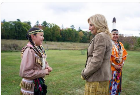
First Lady Dr. Jill Biden · October 13 at 5:44 PM · 📍

Schoolcraft County Democrats October 25 at 2:10 PM · 📍