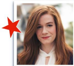
MI Sen. Mallory McMorrow

Come meet Local Democratic Candidates running for office in Leelanau County.